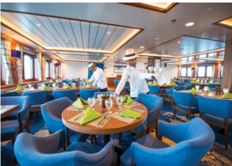
The casual dining room.

Forward lounge and bar for presentations and gatherings, restaurant, large library with Mac computer kiosks, open-air observation deck, underwater gear area and efficient Zodiac boarding platform, and open Bridge, where guests are welcome to learn about navigation from the captain and officers.