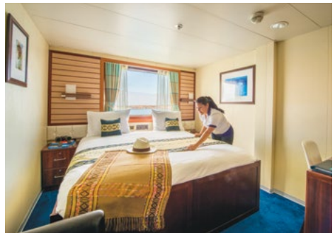
Category 4 cabin.

Served in single, unassigned seating in a sociable, informal atmosphere. Menu emphasizes Ecuadorian flair.