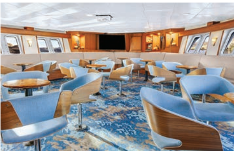
The lounge is the center of life aboard the ship.

Served in single seatings with unassigned tables for an informal atmosphere. Menu emphasizes local fare.