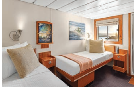
Category 2 cabin with single beds.

All cabins face outside with windows, private facilities and climate controls. Cabins are equipped with Wi-Fi and multiple electrical and USB outlets. Botanically inspired shampoo, conditioner, shower gel and lotion are all available in cabin bathrooms, as well as an Expedition Essentials Kit. Hair dryers, complimentary insulated water bottles and an atlas are available in each cabin.