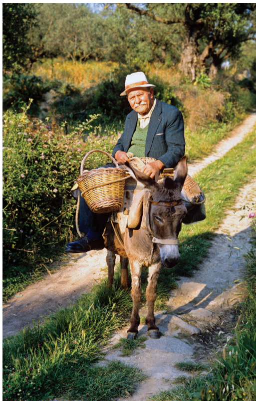
Old ways endure ...

Day 14: Depart for U.S. We transfer to Athens’ international airport this morning, where we connect with our return flight home. B