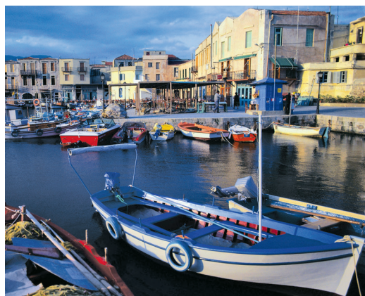
On Day 10, we cruise to Spinalonga.