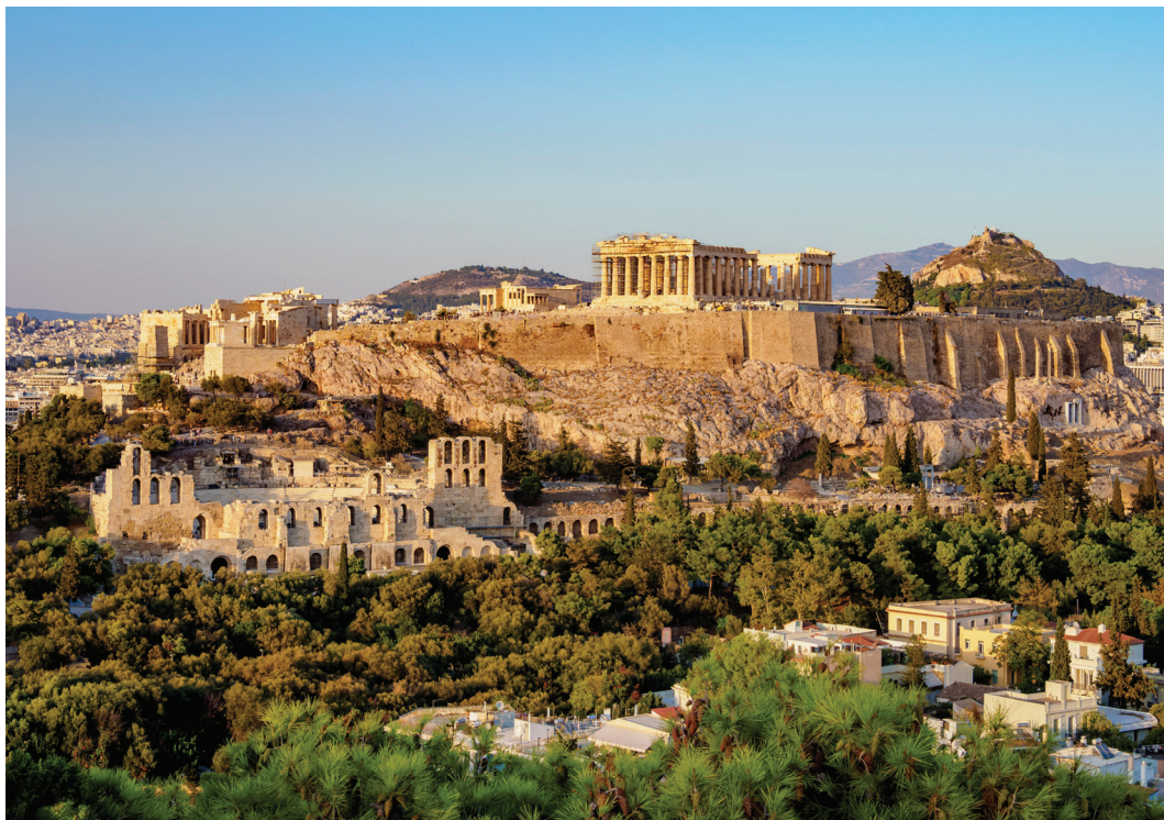
On Day 3 we visit the Acropolis in Athens.

Day 6: Mycenae/Epidaurus It's a day steeped in ancient history as we first tour the imposing ruins at Mycenae, a UNESCO site that represented the pinnacle of civilization from the 15 th to the 12 th centuries BCE. A key influence on the development of classic Greek culture (and hence Western civilization), Mycenae also is linked to Homer's epics, Iliad and The Odyssey . We see the Tomb of Agamemnon, with what was the world's highest and widest dome for more than a thousand years, and the Lion's Gate, the only known Bronze Age monumental sculpture in Greece. We move on the vast archaeological site and museum of Epidaurus, with its 2,300-year-old theater – a master-piece of Greek architecture known for its perfect acoustics – still in use today. Long associated with healing and medicine, Epidaurus comprises one of the most complete sanctuaries remaining from antiquity. Then we return to Nafplion, where the afternoon is free for lunch on our own and perhaps to explore this gem of a Venetian/Byzantine town with picturesque narrow streets, fortifications, and a bounty of waterfront cafés. Tonight, we enjoy dinner together at a local taverna . B,D