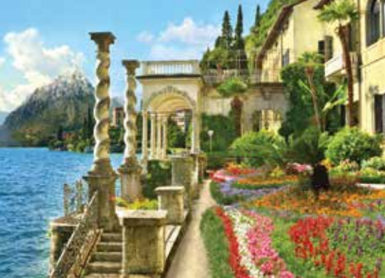
The captivating setting of the Italian Lakes possesses an inexhaustible charm for both travelers and locals alike.