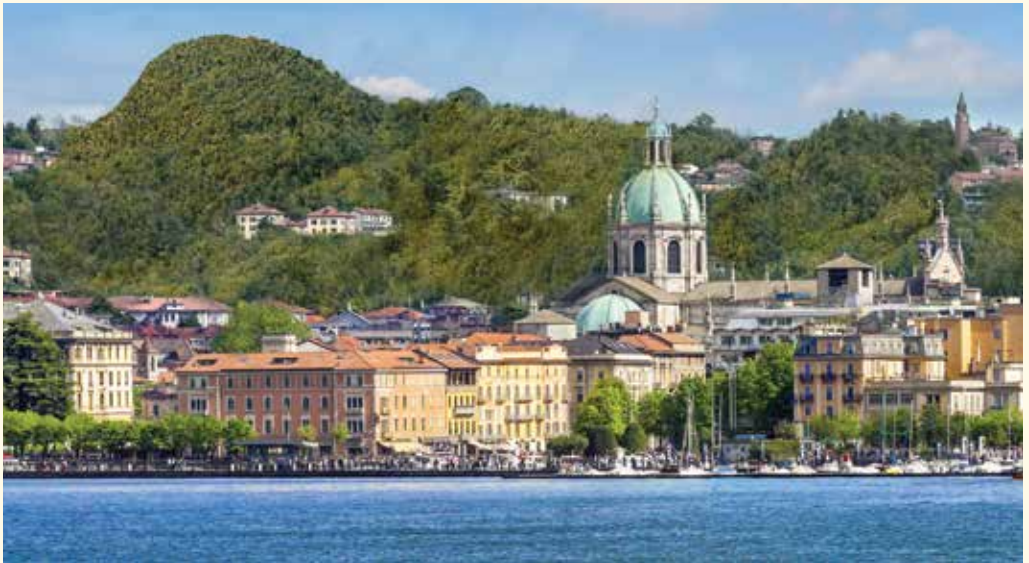
Como features gorgeous architecture at every turn, but perhaps its most iconic building is the Duomo di Como, a 14 th -century Roman Catholic cathedral in the city's historic center. Inset above: Statue at Villa del Balbianello.