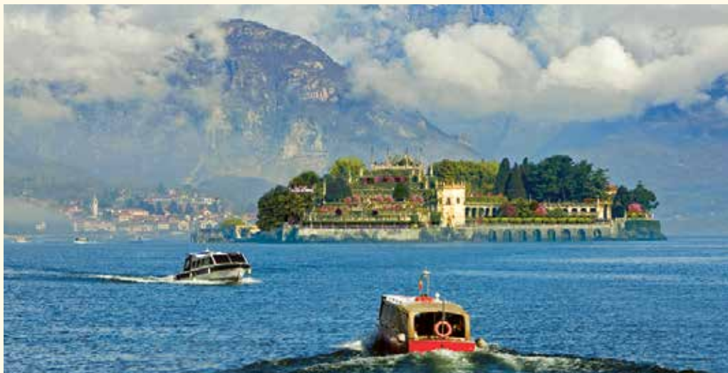
Isola Bella is the most spectacular of the Borromean Islands, located on the Italian side of Lake Maggiore. Visit a magnificent 16 th -century villa and stroll through one of the most beautiful gardens in the world.