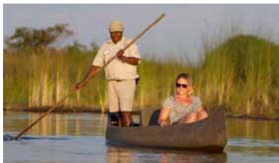
Gliding through the Okavango Delta in a mokoro canoe.