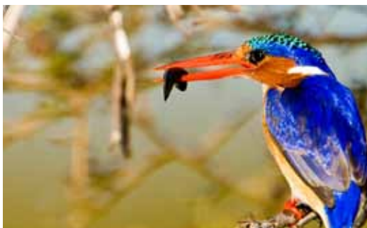
The jewel-toned Malachite Kingfisher enjoying breakfast.