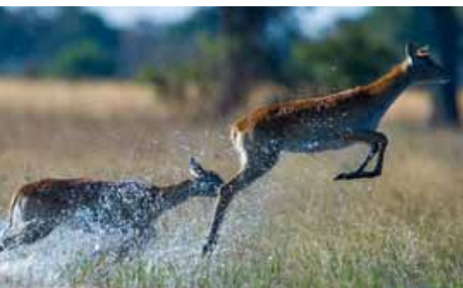
Lechwe in the wetlands.

Enjoy one last wildlife run this morning before your transfer to Maun by light aircraft for your return flights home, bringing with you the memories of all the wonderful sights of Southern Africa.