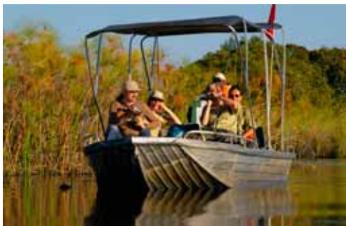
Observing the bounty of African wildlife on the water.

The MIT Alumni Travel Program provides further information about the Travel Program and the relationship between the Alumni Association and the tour operator online at: alum.mit.edu/travel/About