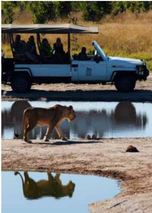
A lioness keeps watch over a safari group in the Delta.