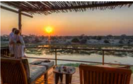
In awe of the sunrise at Leroo La Tau, the view from your room.

End your journey with a retreat in Cape Town. Enjoy stunning accommodations at the historic Taj Cape Town. Ascend Table Mountain and take the coastal route to the Cape of Good Hope to discover spectacular wildlife and the braying “jackass” penguins at Boulders Beach. Tour the brilliant Kirstenbosch Botanical Gardens and spend a day in the famed Boland Valley wine region. Visit the settlement of Khayelitsha with a township guide and get an eye-opening historical tour of Robben Island.