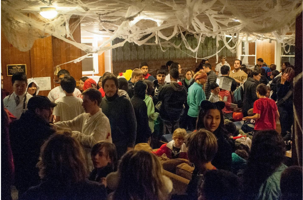
ZBT's common room is packed during the Brookline Community Haunted House; Alumni return to help with the event. Parents often bring their children to the event because they attended when they were kids!