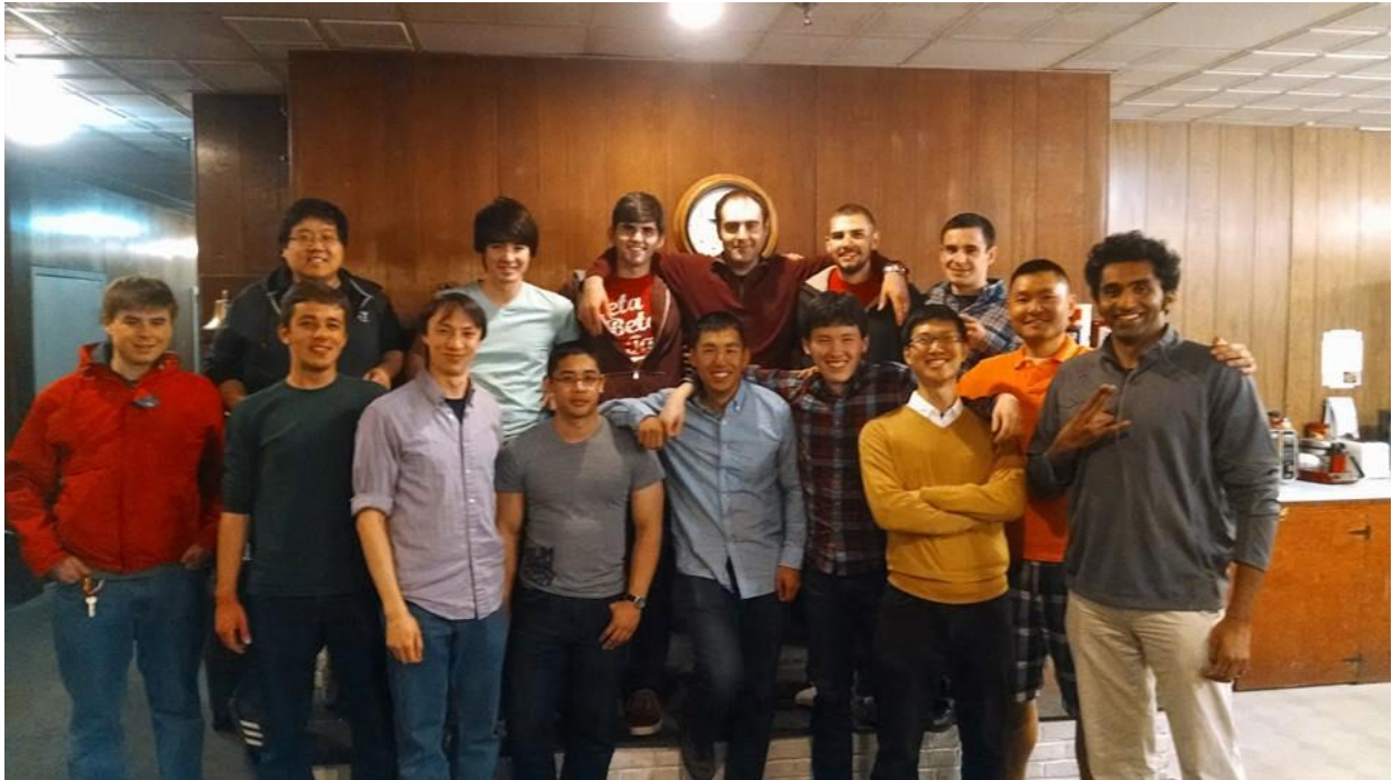
The Alumni who stuck around until the Sunday morning Trustee Board Meeting at the end of Alumni Weekend 2014 pose in front of the ZBT fireplace